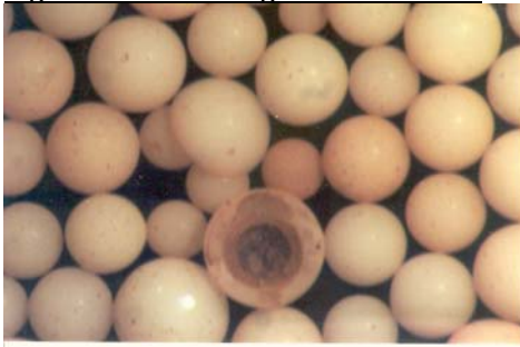
Figure 1 – Fe fouling of resin center.

The solid core (see figure 2) provides for the superior performance by preventing fouling, and allowing for higher chemical conversion