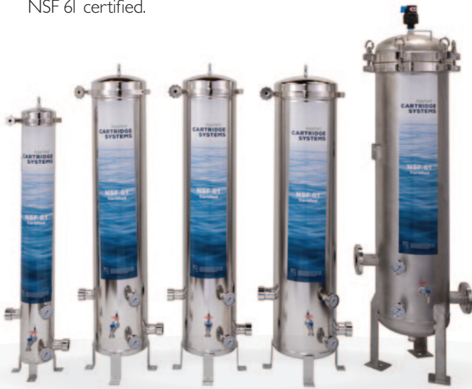
5, 10, 15, 20 & 25 GPM Freestanding models