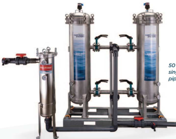
50 GPM Skid with single-bag prefilter and piping sub-assembly.

With simple inlet/outlet flange connections and pre-plumbed piping sub-assemblies, in many cases a cartridge system can be completely assembled and ready to hook-up to your water supply in less than one day.