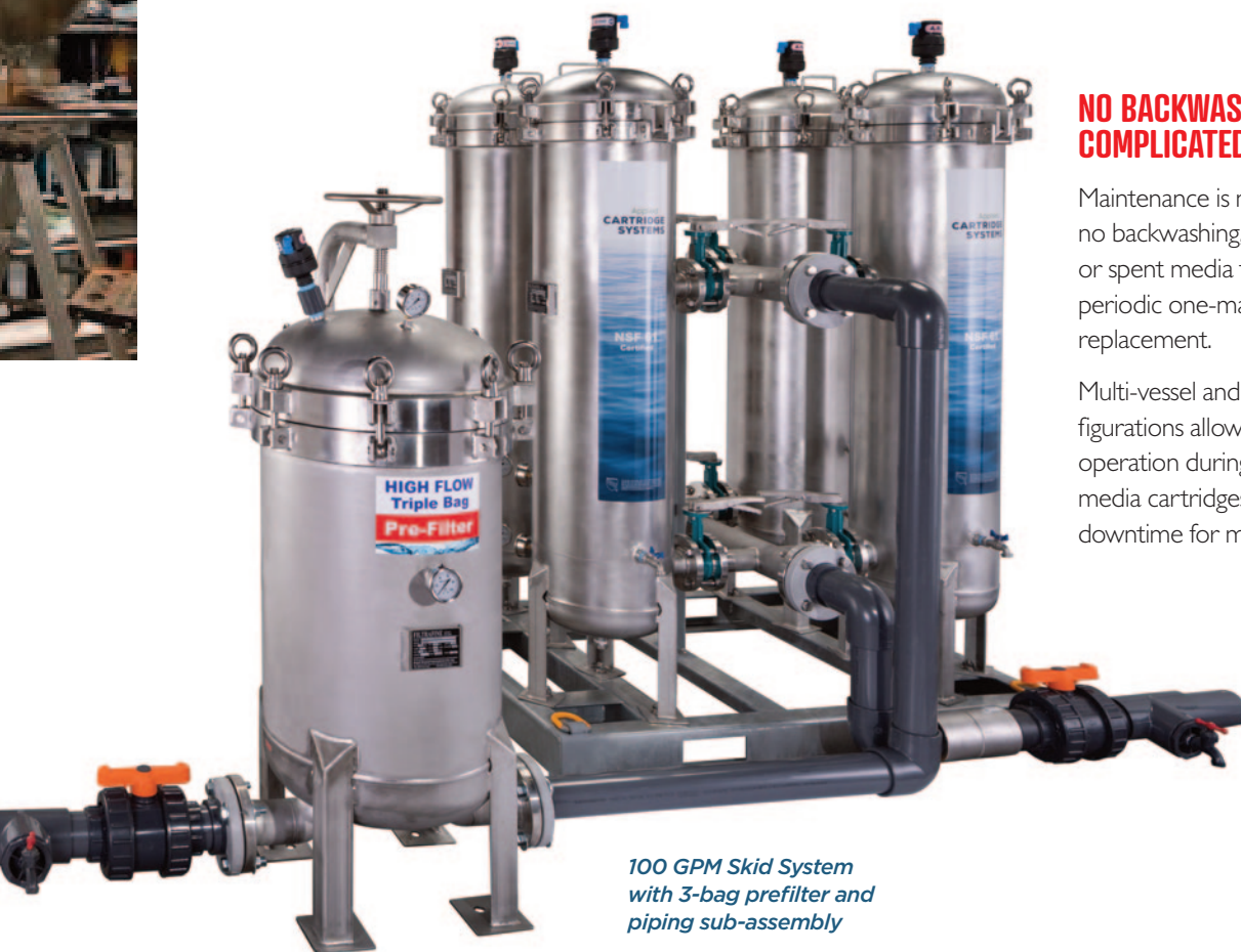
100 GPM Skid System with 3-bag prefilter and piping sub-assembly