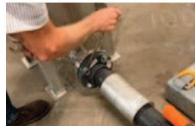
Quick, easy installation with pre-plumbed piping sub-assemblies.

Applied Cartridge Systems are exceptionally user-friendly and convenient to work with. There is no backwashing, bulk media replacement or hazardous waste streams to dispose of.