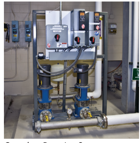
Complete Pumping Systems