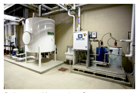
Rainwater Harvesting Systems