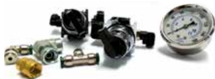
Plate Shifters and Retrofits

Gauges, switches, and valves or complete replacement control panels are in inventory, specified to match original components for quick, easy replacements or upgrades.