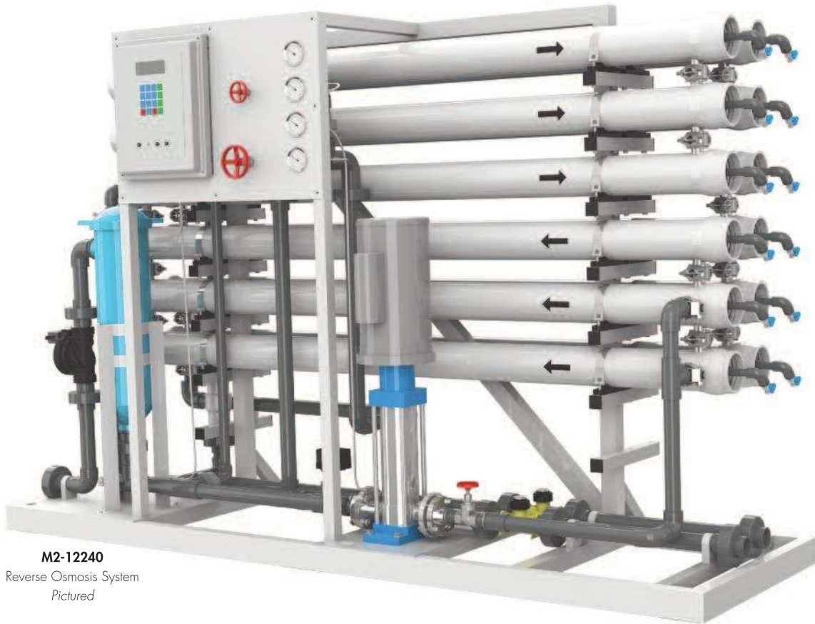
M2-12240 Reverse Osmosis System Pictured