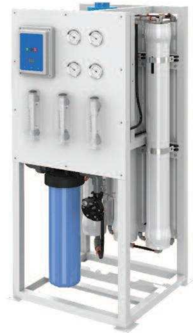
R1-6140 Reverse Osmosis System Pictured

AXEON offers customers flexibility with a comprehensive product offering. Begin experiencing a higher level of product quality, customer and technical support, and the many benefits of working with AXEON Water Technologies .